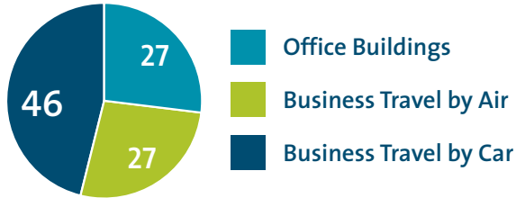
GLOBAL – CO 2 EMISSIONS BY RESOURCE (PERCENT)