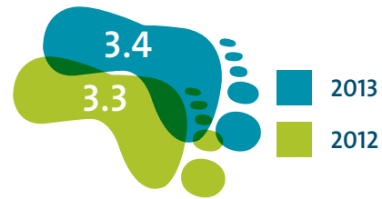
CO 2 FOOTPRINT (TONNES PER EMPLOYEE)